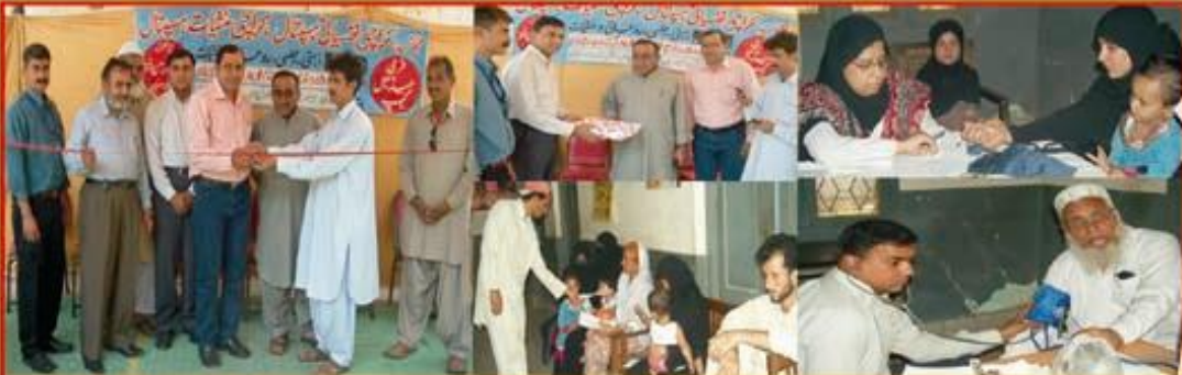
Free Medical Camp organized by Karachi Psychiatric Hospital at Pak Colony.